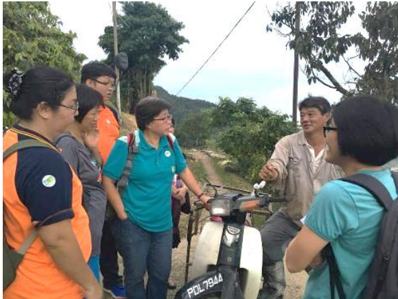
Teachers connecting with farmer community to map the place and issues of Penang Hill.