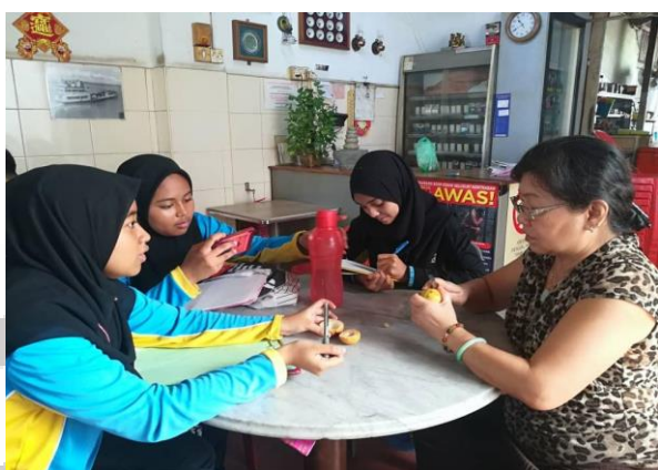
Interviewing a coffee shop owner about the uses of nutmeg

Using specially-designed programmes that are diverse in cultural themes and levels, we highlighted place-based and community-based learning. This was done using various creative tools or media like interactive trails, traditional games, craft, visual art, performing and culinary arts.