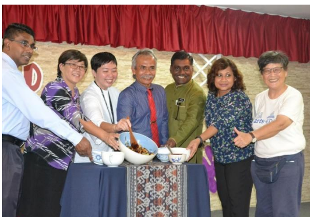
Sekolah Budaya Warisan launched with the ceremony of rojak-making. Each ingredient represented a party involved.