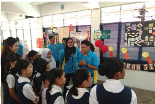
Participants sharing their work process in researching P.Ramlee

For more info, refer to Project page: https://www.facebook.com/CHEP.Penang/