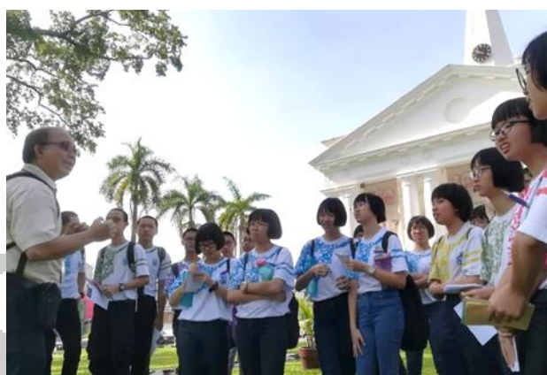
Participants listen to how Europeans started to build a community around the St. George's Church