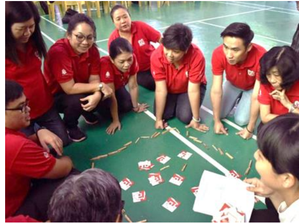
Exposure to different methods of learning – visual mapping of memories of George Town.