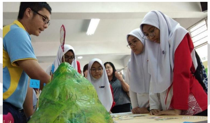
Model of Penang Hill to better showcase the landslide incident last year